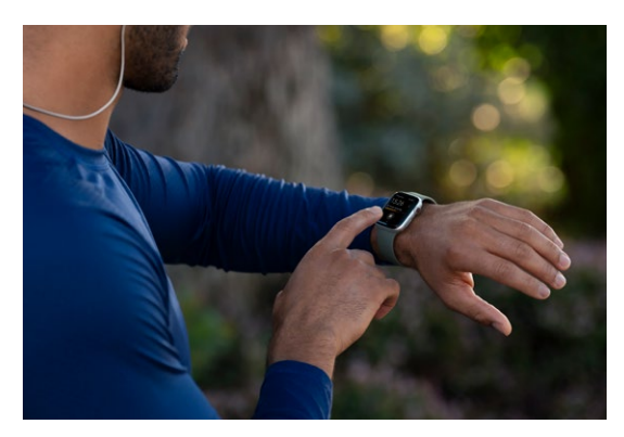
New Apple Watch integration

launch, over 75% of workouts taken on the app were in floor-based class categories such as strength, stretching, yoga and meditation. With the launch of our Apple Watch integration, we provide our Members with another way to enhance the Peloton experience on iOS with workout metrics such as heart rate for all class types. Bringing the Peloton experience to more devices is one way we continue to drive engagement with our Connected Fitness Subscribers. With the app, which is included with the Connected Fitness Subscription, Members can augment their Bike or Tread workouts with a variety of complementary classes and access to our library of class content when traveling.